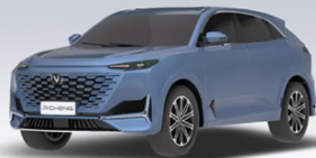
● DARK BLUE