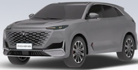
● LIGHT GREY