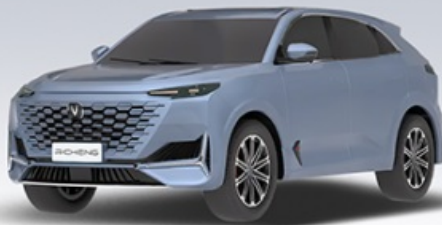
● LIGHT BLUE