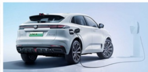
▲ High poly energy PHEV power battery