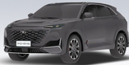
● DARK GREY