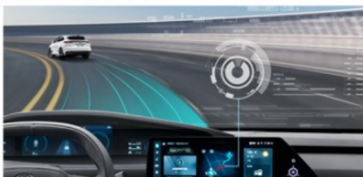
▲ iDD intelligent control system